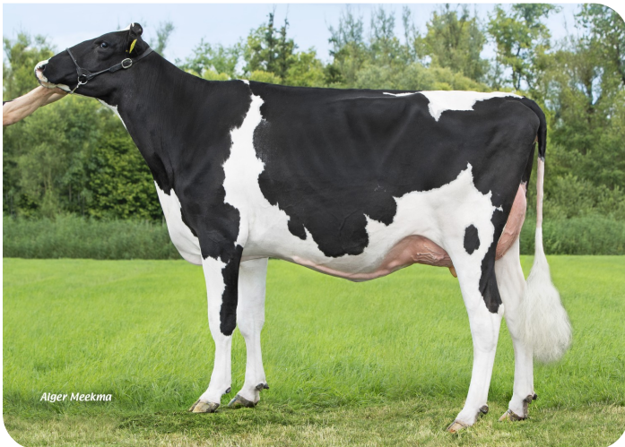
Empore 1 (s. Centrum)

Owner: Melkveebedrijf Hammink VOF, Almelo (NL)