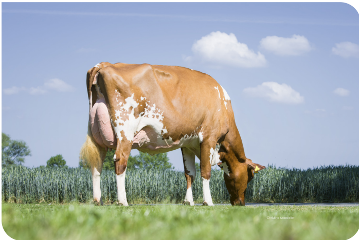
WR Miley (EX 91) Dam of Centrum