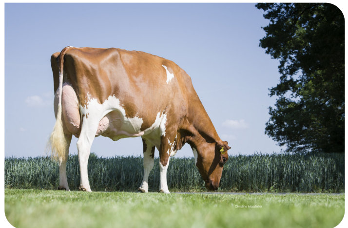
WR Monroe (EX 90) Grand dam of Centrum