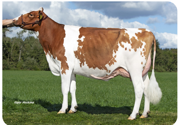
Grashoek Groliena 43 (s. Centrum) Owner: Fok- en melkveebedrijf K.I. Samen B.V., Grashoek (NL)