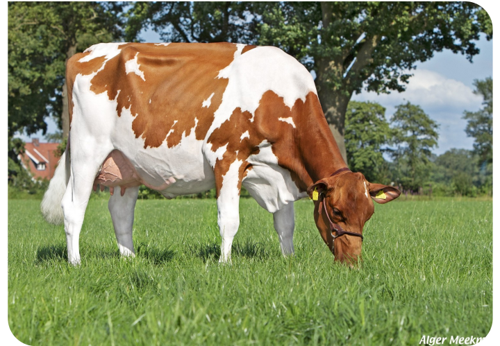
Geertje 795 (s. Centrum)