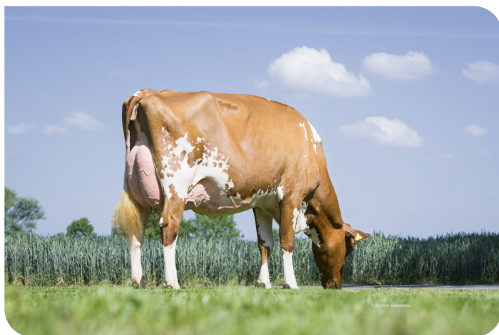
WR Miley (EX 91) Dam of Centrum