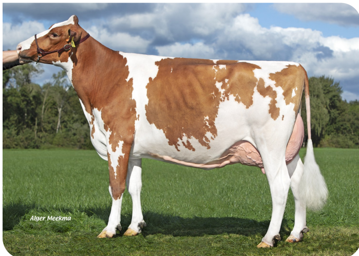
Grashoek Julia 123 (s. Centrum)

Owner: Fok- en melkveebedrijf K.I. Samen B.V., Grashoek (NL)