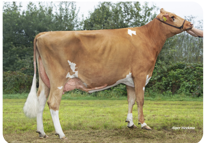
Lian 482 (s. Centrum)

Owner: Fok- en melkveebedrijf K.I. Samen B.V., Grashoek (NL)