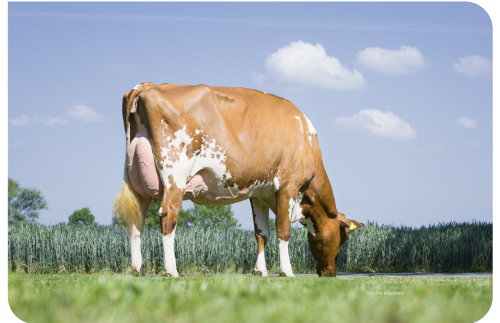
WR Miley (EX 91)