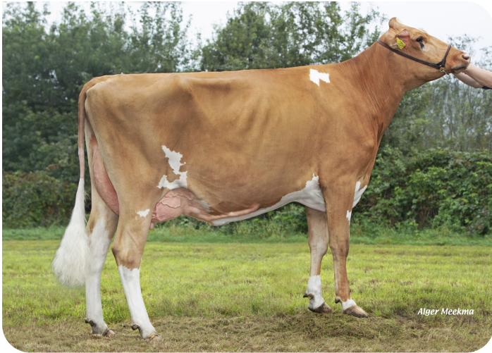
Lian 482 (s. Centrum) Owner: V.O.F. van Mensvoort, Berkel-Enschot (NL)