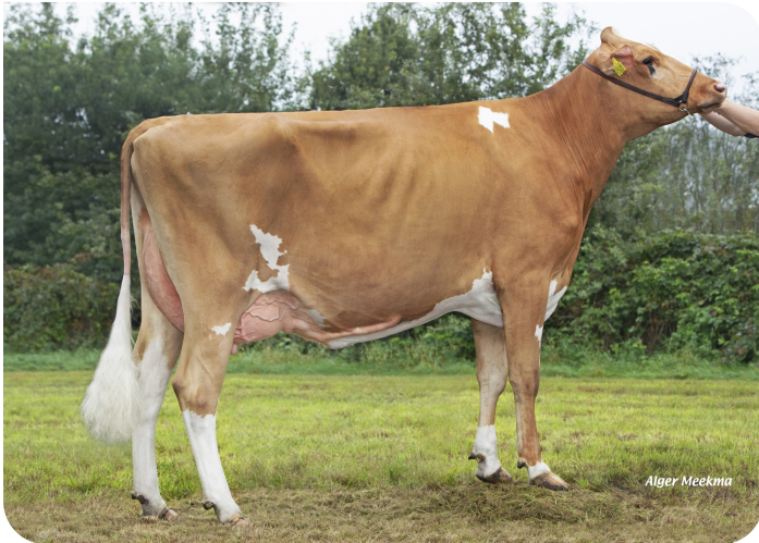
Lian 482 (s. Centrum)

Owner: V.O.F. van Mensvoort, Berkel-Enschot (NL)