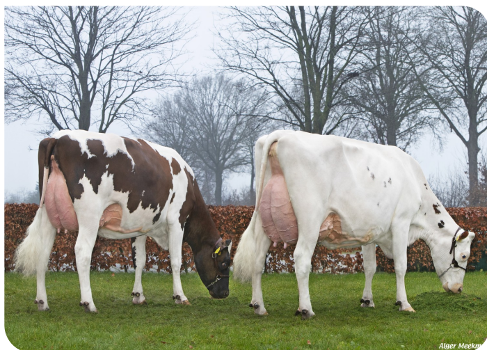
Wilskracht Warsi 1112 (Dam of Allianz P)