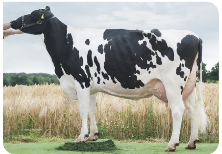
Wil Kanu (VG 88) (dam of Riverstone)