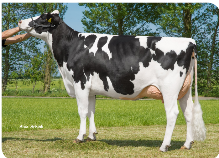
Skalsumer Pietje 981 Grand dam of Paw Patrol