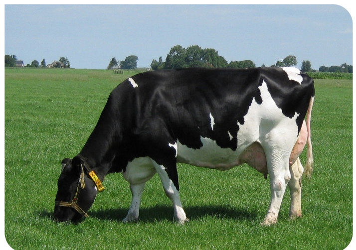
Skalsumer Pietje 736 Great-great grand dam of Paw Patrol