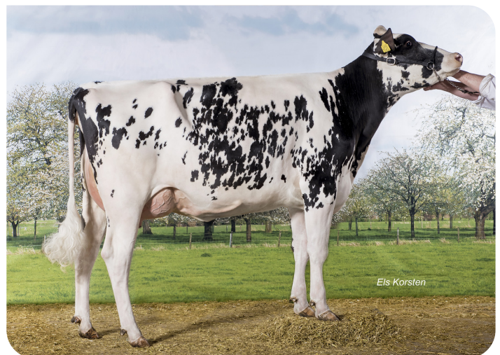
Willem's Hoeve Rita 1562 (s. Xtrem rf) Owner: Firma D. de Jong en Zoon, Buren (NL)