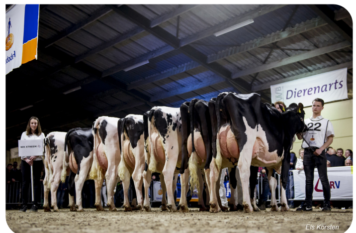
Daughtergroup of Xtream WH rf Bloesemshow Zoelen 2018