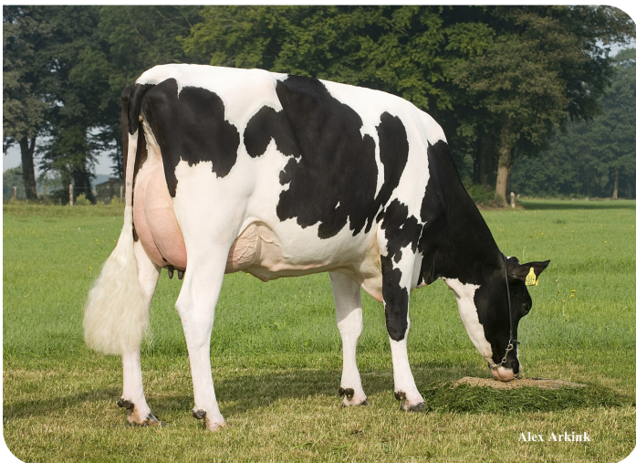
Weggelhorster Dirndel 35 (VG 88) (dam of Undercover)