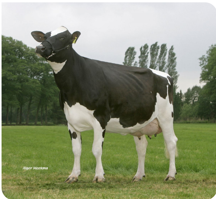
Weggelhorster Regate 1 (s. Santana)