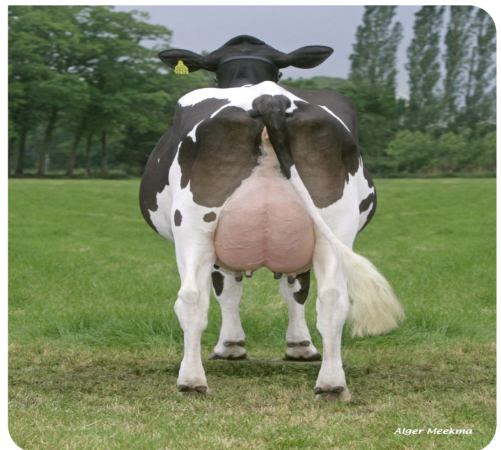
Weggelhorster Regate 1 (s. Santana)