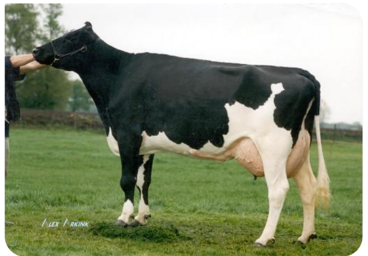
Hannita 34 (VG 89) (granddam of No Doubt rf)