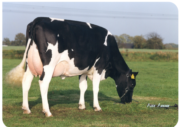
Weggelhorster Dirndel 24 (EX 90) (granddam of Ashburton)