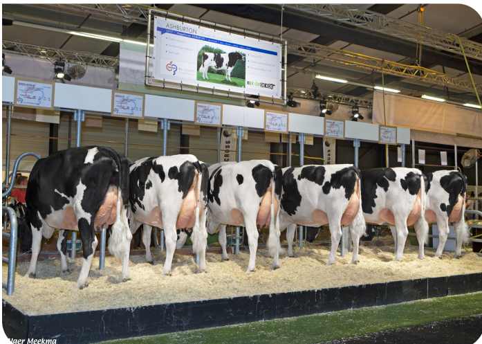
Ashburton daughtergroup Hardenberg 2017