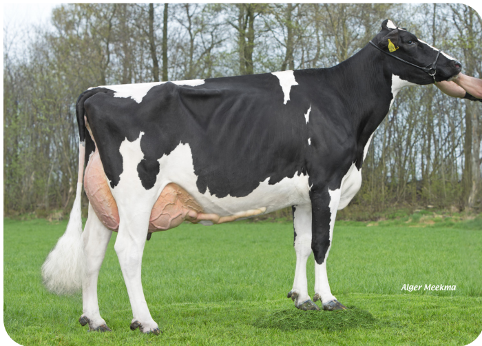
Maaike 360 (s. Ashburton) Owner: Vreba Melkvee B.V., Vredepeel (NL)

2.00 317d 10702 kg 4.42% 3.51% 3.00 333d 11154 kg 4.88% 3.83% 4.00 299d 10785 kg 4.96% 3.79% 5.00 338d 15122 kg 4.66% 3.55% 6.01 373d 17976 kg 4.74% 3.62% 7.05 358d 17387 kg 4.55% 3.45% 8.07 427d 14288 kg 5.43% 3.71% 91 90 89 EX 90