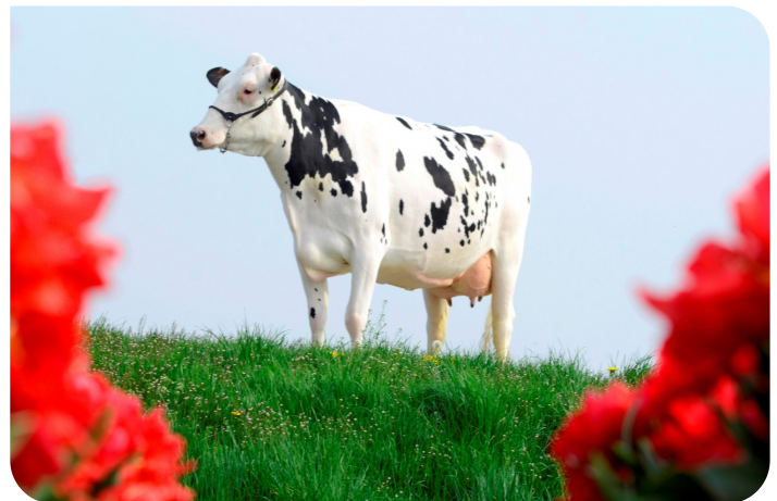
VVH Isa 12 (EX 90) (granddam of Snapshot VVH)