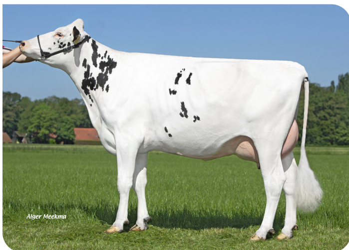
Nella 1419 (s. Snapshot)