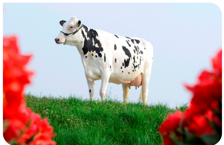
VVH Isa 12 (EX 90)