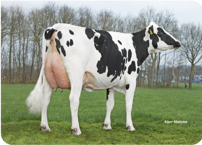
Grashoek Julia 92 (s. Repairman) Owner: Melkveebedrijf Grashoek b.v., Grashoek (NL)