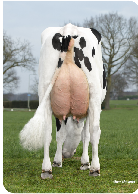
Grashoek Julia 92 (s. Repairman) Owner: Melkveebedrijf Grashoek b.v., Grashoek (NL)