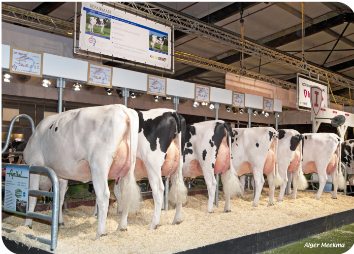
Repairman daughtergroup Hardenberg 2018