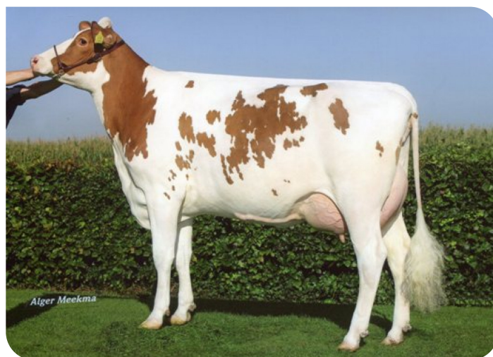
VVH Classic Maxima (VG 87) (dam of Domax Red)

Breeder: Van Veelen Holsteins, Biddinghuizen