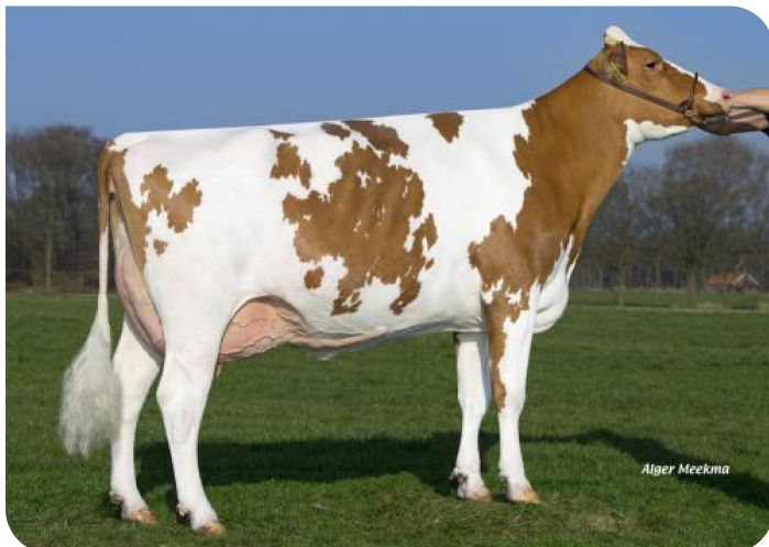
Dikkie 76 (s. Domax Red)