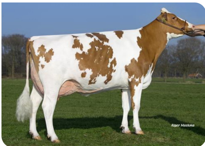
Dikkie 76 (s. Domax Red)