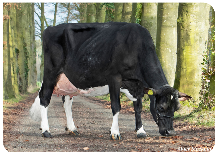
VDR Sandra 2 Grand dam of Stravinsky