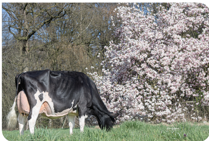
VDR Sandra 5 Dam of Stravinsky