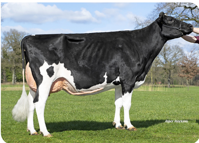
VDR Sandra 5 Dam of Stravinsky