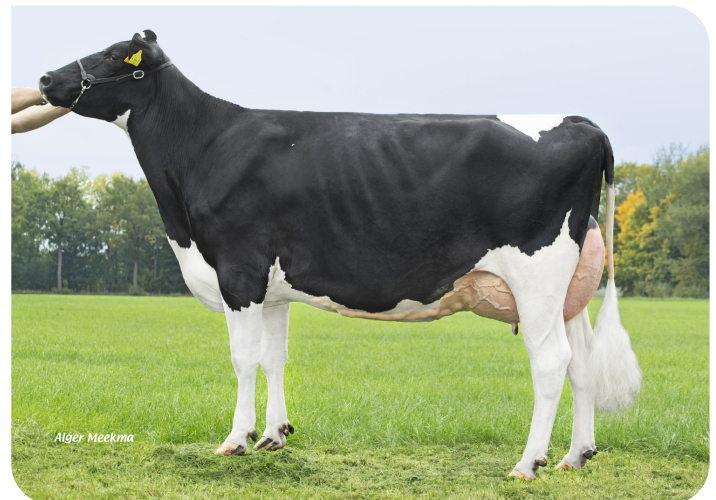
Grashoek Vrije Tulp 81 (VG 87) (v. Slash) Owner: Fok- en melkveebedrijf K.I. SAMEN, Grashoek