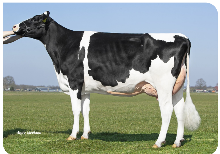
Leida 769 (s. Slash) Owner: V.O.F. Miskotte, Den Ham (NL)