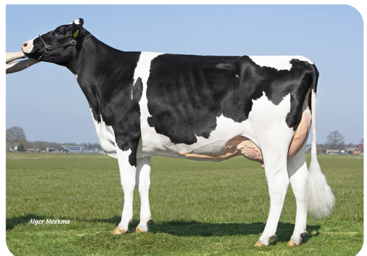
Leida 769 (s. Slash) Owner: V.O.F. Miskotte, Den Ham (NL)