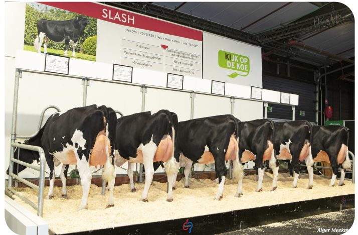
Daughter group VDR Slash RMV Hardenberg 2021