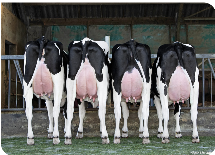
Leida 777, Leida 769, Fennie 287 & Leida 77 (s. Slash) Owner: V.O.F. Miskotte, Den Ham (NL)