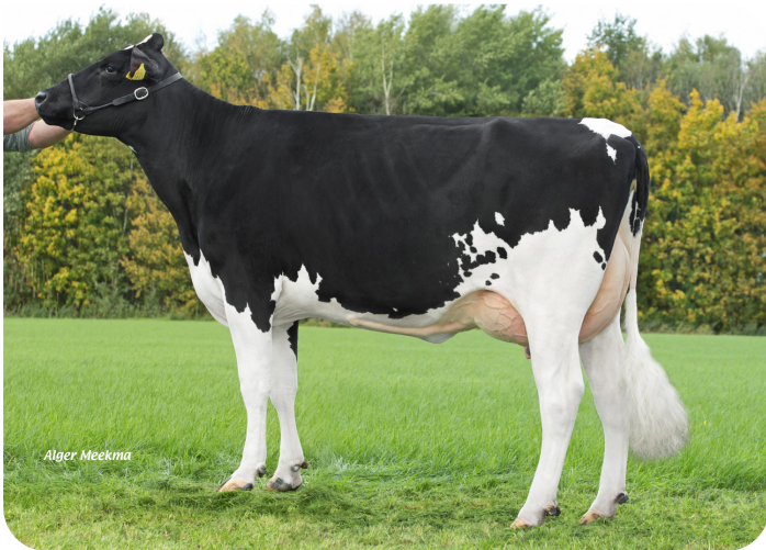
Grashoek Liesje 11 (s. Slash) Owner: Melkveebedrijf Grashoek, Grashoek (NL)