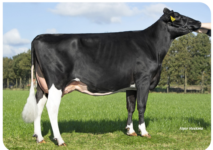
Marianne 358 (s. Tobor) Owner: Te Voortwis C.V., Winterswijk-Miste (NL)