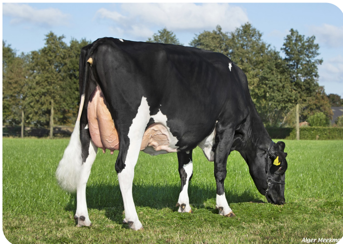
Marianne 359 (s. Tobor) Owner: Te Voortwis C.V., Winterswijk-Miste (NL)