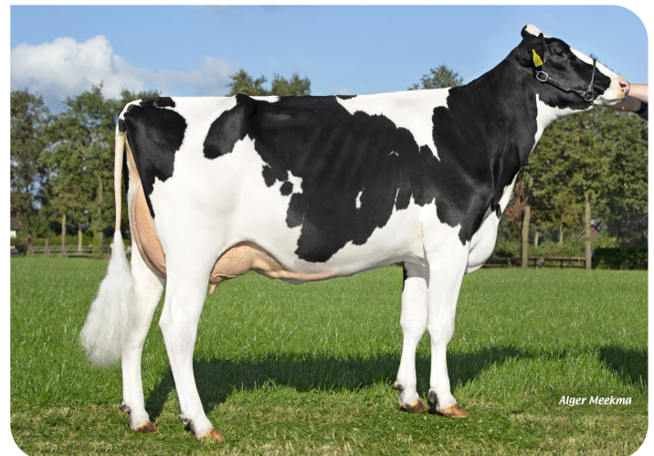
Marianne 361 (s. Tobor) Owner: Te Voortwis C.V., Winterswijk-Miste (NL)