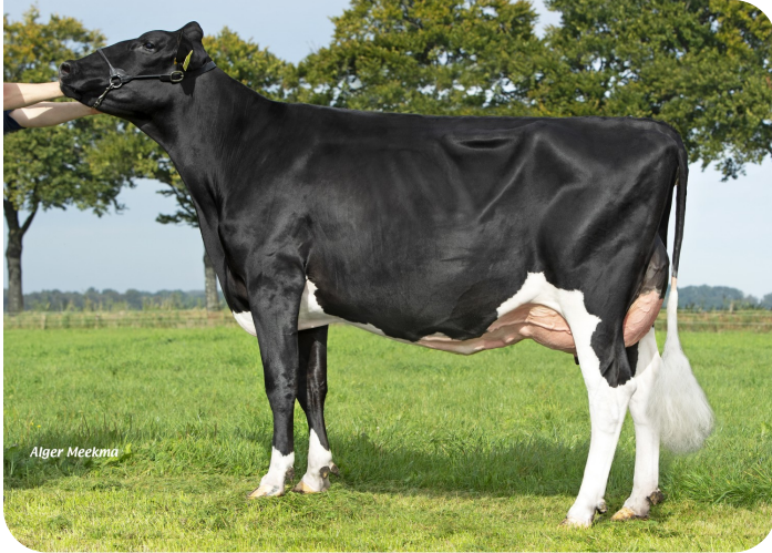
Thea 271 (s. Tobor) Owner: VOF Melkveebedrijf Waterink, Beerzerveld (NL)