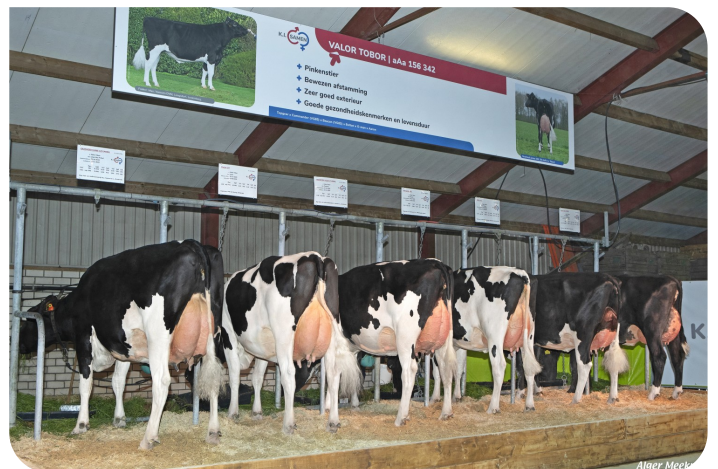
Offspring of Valor Tobor, Grasdag 2023 Grashoek (NL)