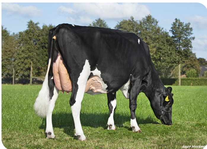
Marianne 359 (s. Tobor) Owner: Te Voortwis C.V., Winterswijk-Miste (NL)