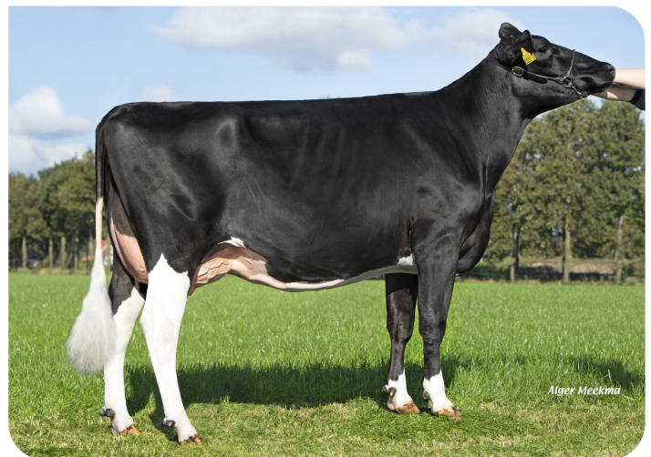
Marianne 358 (s. Tobor) Owner: Te Voortwis C.V., Winterswijk-Miste (NL)