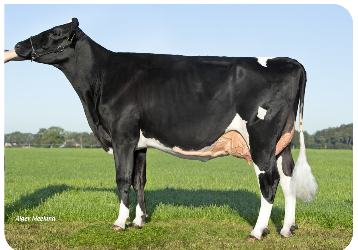
Pietje 81 (s. Tobor)

Owner: Maatschap Schoneveld, Bathmen (NL)