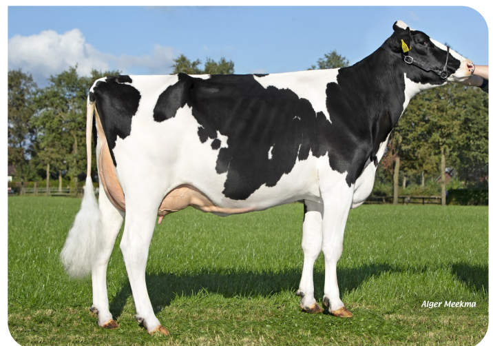
Marianne 361 (s. Tobor) Owner: Te Voortwis C.V., Winterswijk-Miste (NL)