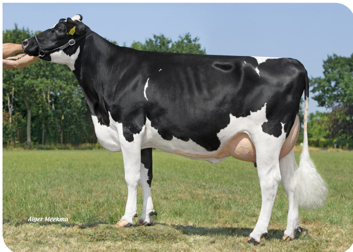
Grashoek Sneeker 308 (s. Mexx) Owner: Melkveebedrijf Grashoek b.v., Grashoek (NL)