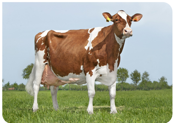
Grashoek Rita 74 (s. Mexx)

Owner: Fok- en melkveebedrijf K.I. SAMEN, Grashoek (NL)