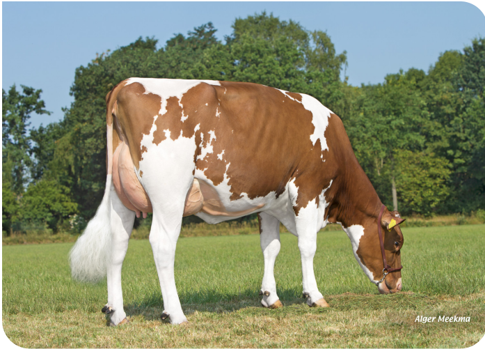
Grashoek Rita 74 (s. Mexx)

Owner: Fok- en melkveebedrijf K.I. SAMEN, Grashoek (NL)