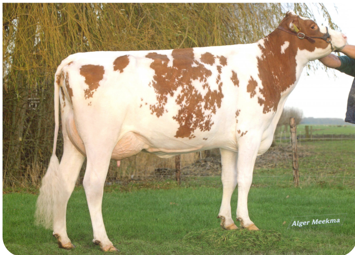
Topspeed Gaby (VG 89) (dam of Samoa rf)