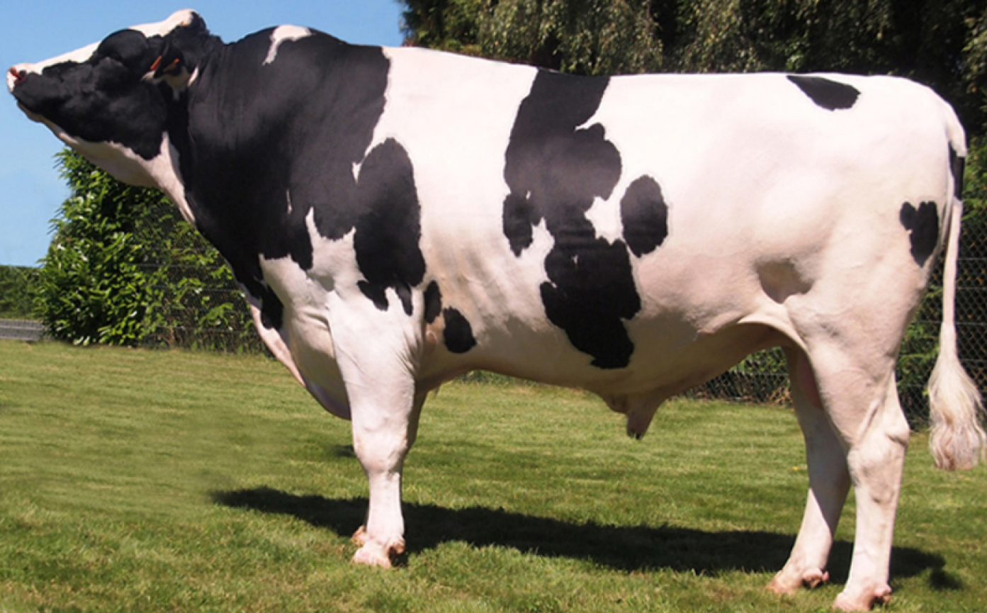
Breeder: Veeteeltbedrijf Wigboldus