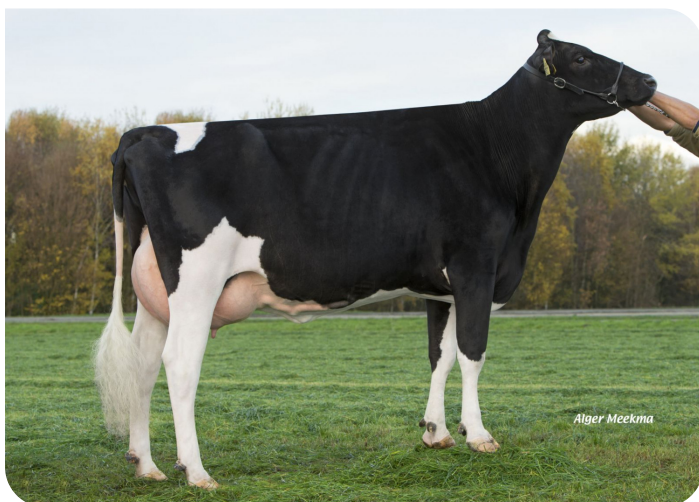
Grashoek Marjan 11 (s. Moonshine)

Owner: Melkveebedrijf Grashoek b.v., Grashoek (NL)