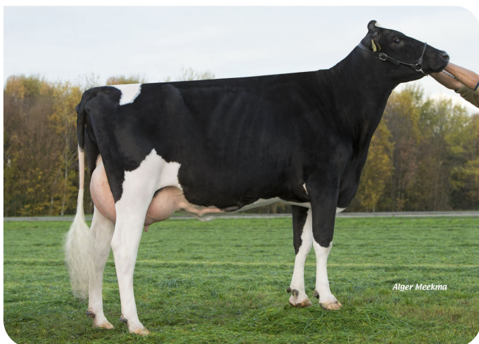
Grashoek Marjan 11 (s. Moonshine)

Owner: Melkveebedrijf Grashoek b.v., Grashoek (NL)