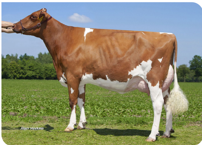
Grashoek Roza 98 (s. Moonshine) Owner: Melkveebedrijf Grashoek b.v., Grashoek (NL)