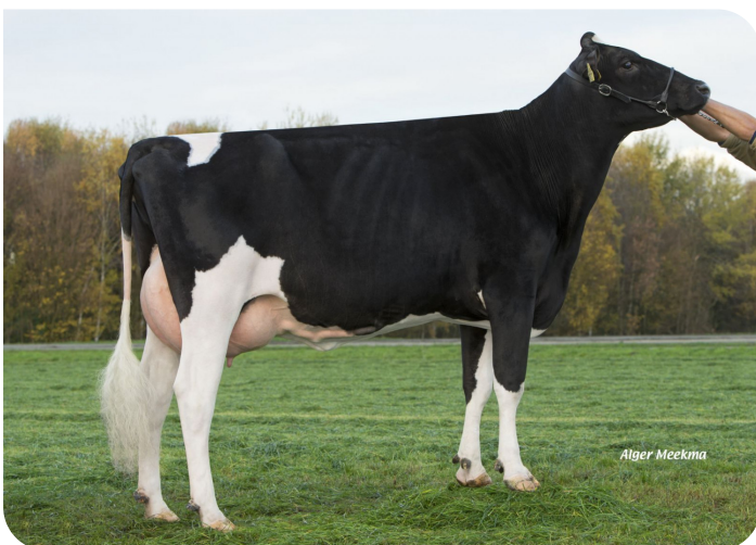
Grashoek Marjan 11 (s. Moonshine) Owner: Melkveebedrijf Grashoek b.v., Grashoek (NL)