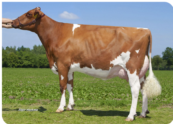
Grashoek Roza 98 (s. Moonshine) Owner: Melkveebedrijf Grashoek b.v., Grashoek (NL)