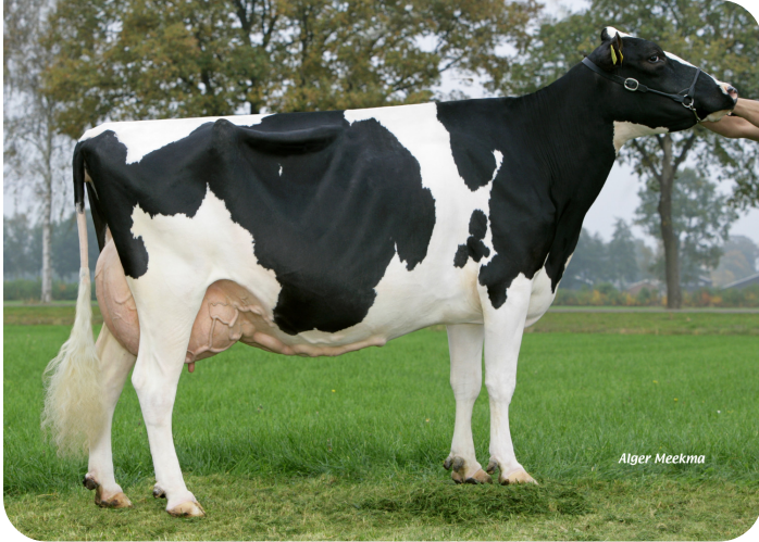
Quarrel 11 (VG 87) (dam of Aquarel)