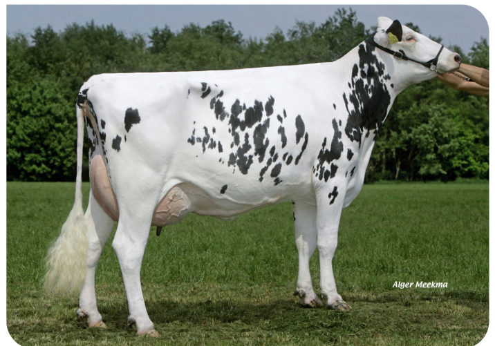
Klara 22 (s. Sheriff)