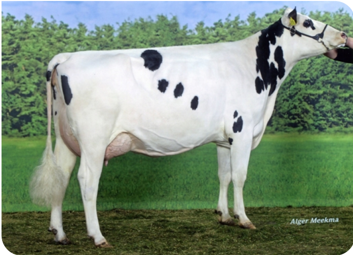
Southland Dellia 101 (VG 88) (half-sister of Sheriff)