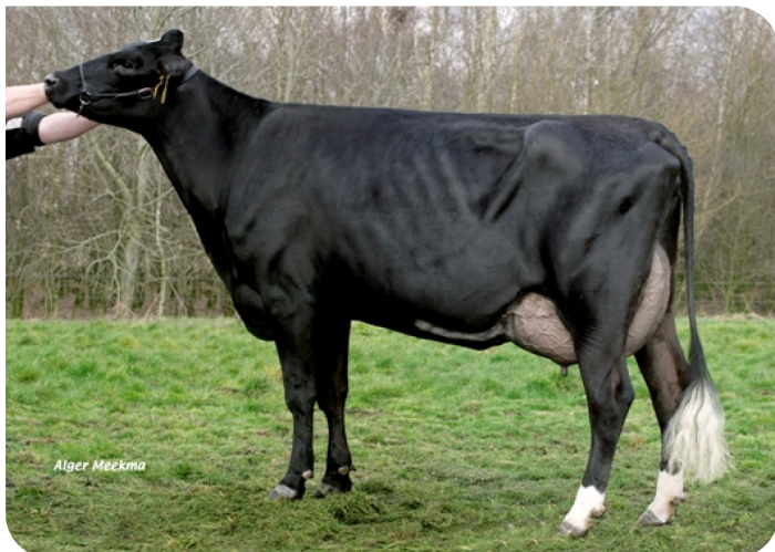
Pineut (VG 87) (s. Image)

Owner: Melkveebedrijf Engelen v.o.f. (NL)