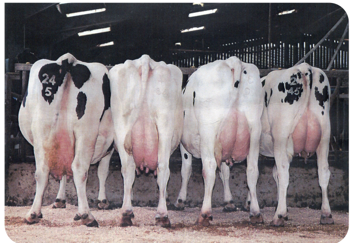
4 Generations Risky