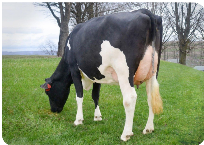
Scenic-Vista Ardels Raya-ET-P Full sister of Radix-P rc Owner: Scenic-Vista Farms, Western Maryland, USA