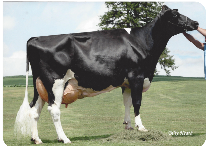
Elk-Lick Durhm Ardel Lea-ET (EX92) (grand-dam of Radix-P rf)