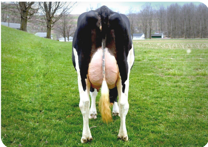
Scenic-Vista Ardels Raya-ET-P Full sister of Radix-P rc Owner: Scenic-Vista Farms, Western Maryland, USA