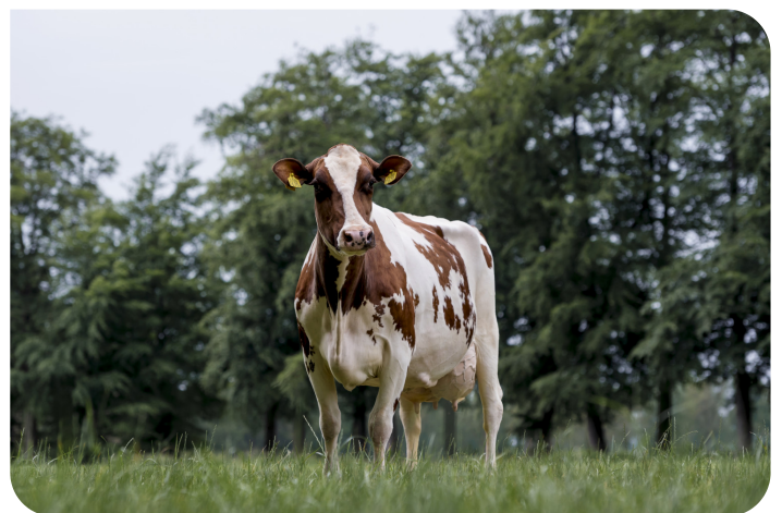
Daatje 2670 (dam of Sandron)