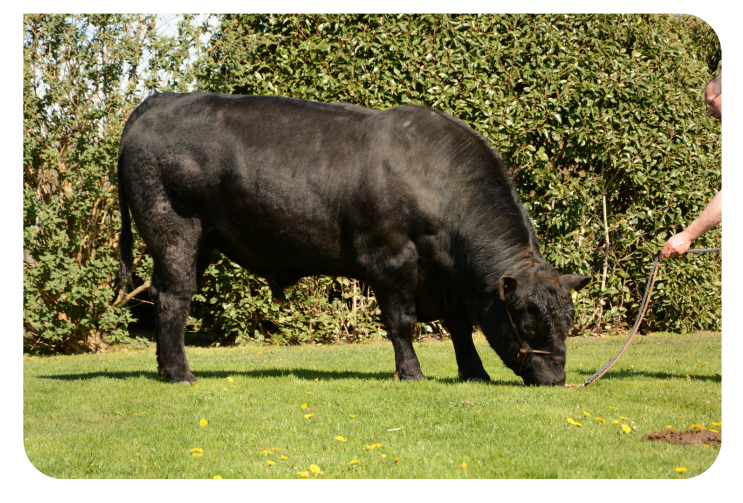
Roydmoor Franklyn T496