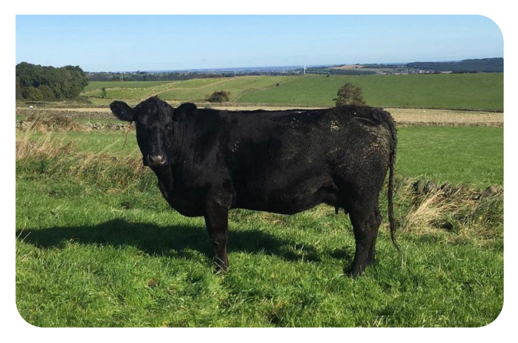
Netherton Fleur L650 (dam of Franklyn)