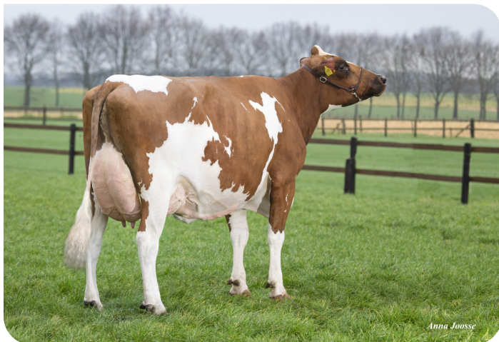
Justine (VG 88) Dam of Musthave Red