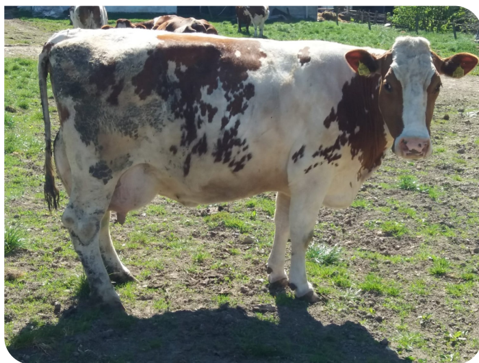
Dea (dam of Rintje)