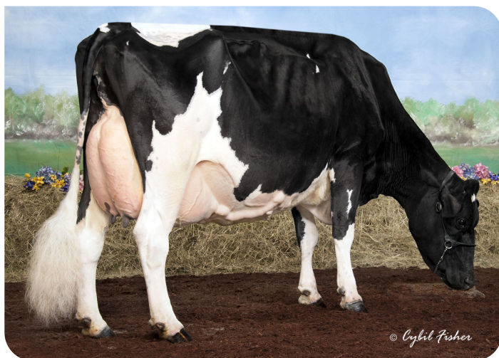
Ridgedale Folly (EX 96) (dam of Felon)