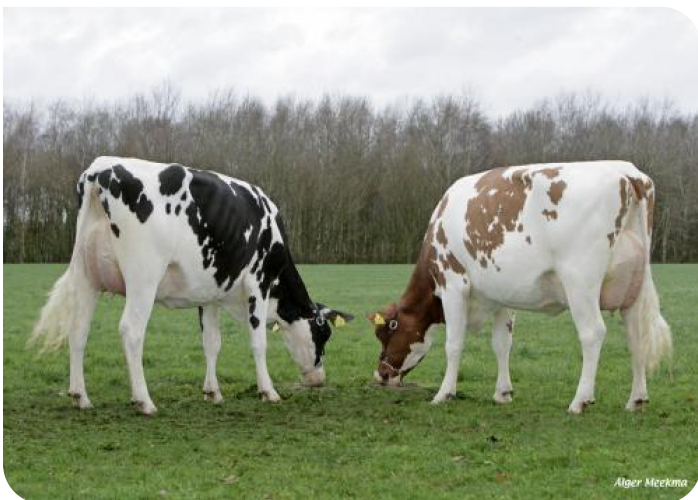
Maga 75 & Irma 28 (s. Norwin rf) Owner: V.O.F. Gebleektendijk, Nederweert-Eind (NL)