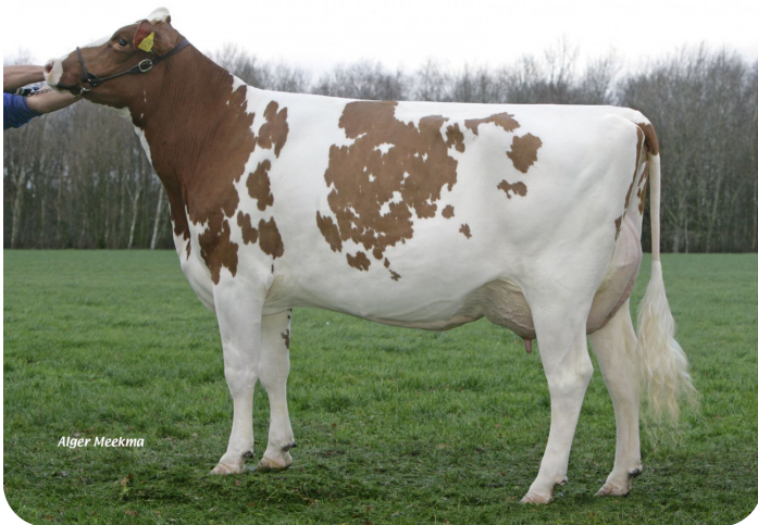
Irma 28 (s. Norwin rf) Owner: V.O.F. Gebleektendijk, Nederweert-Eind (NL)