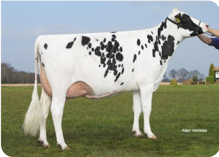
Grashoek Angel 51 (s. Norwin rf) Owner: Melkveebedrijf Grashoek b.v., Grashoek (NL)