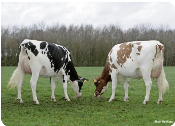
Maga 75 & Irma 28 (s. Norwin rf) Owner: V.O.F. Gebleektendijk, Nederweert-Eind (NL)