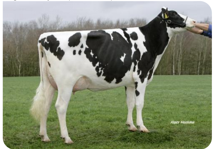
Maga 75 (s. Norwin rf) Owner: V.O.F. Gebleektendijk, Nederweert-Eind (NL)