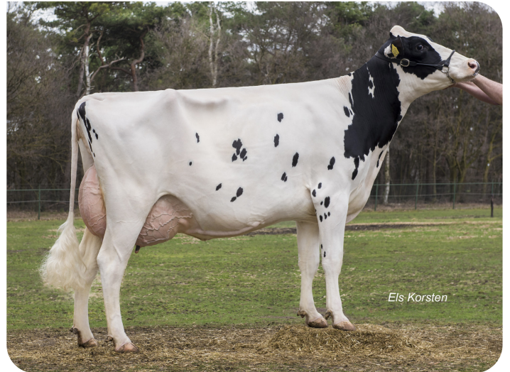
Angels Wiesje 46 (s. Norwin rf)