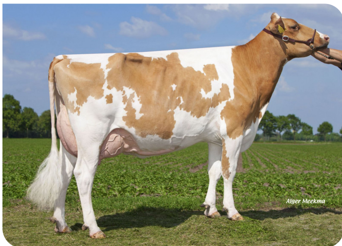
Grashoek Blutchen 51 (EX 90) (s. Norwin rf) (2nd lactation) Owner: Melkveebedrijf Grashoek b.v., Grashoek (NL)