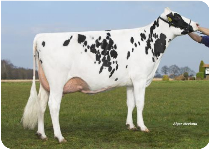
Grashoek Angel 51 (s. Norwin rf) Owner: Melkveebedrijf Grashoek b.v., Grashoek (NL)