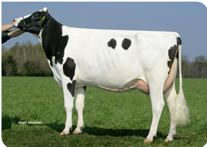
Everett 3 (VG 86) (s. Norwin rf) Owner: Melkveehouderij Verwielen v.o.f., Hunsel (NL)