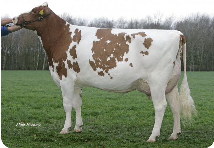
Irma 28 (s. Norwin rf) Owner: V.O.F. Gebleektendijk, Nederweert-Eind (NL)