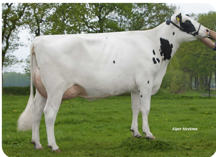
Jacolien 1 (VG 86) Great-granddam of Joran P (Pp)