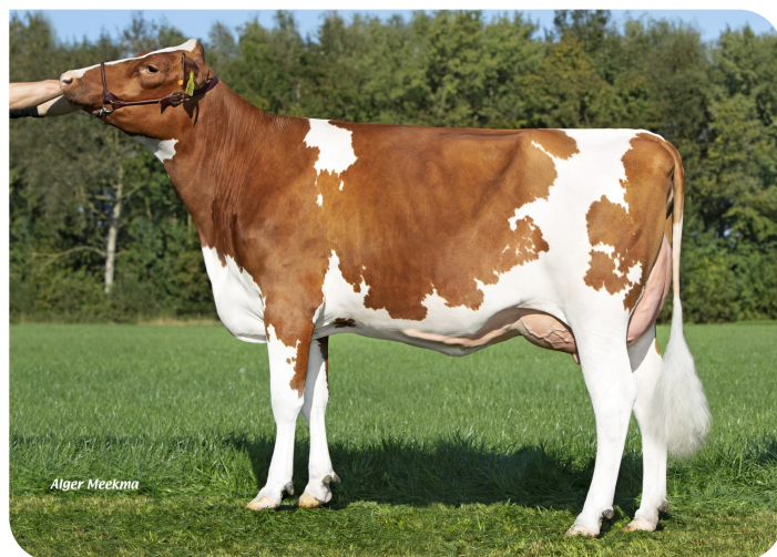
Grashoek Rieka 75 (s. Joran P)

Owner: Fok- en melkveebedrijf K.I. Samen B.V., Grashoek (NL)