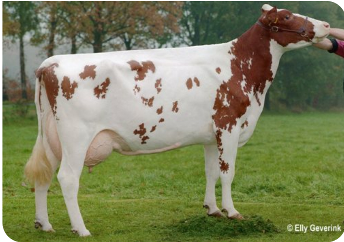
Florina (VG 88) (dam of Frontier)