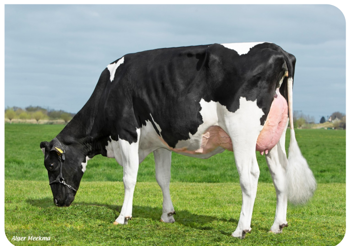
Poppe Red Hot Feather(VG 87) Dam of Freebird Red