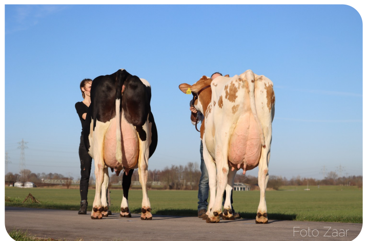
Den Hamer Red Hot Feebe and Poppe Fienchen 1270