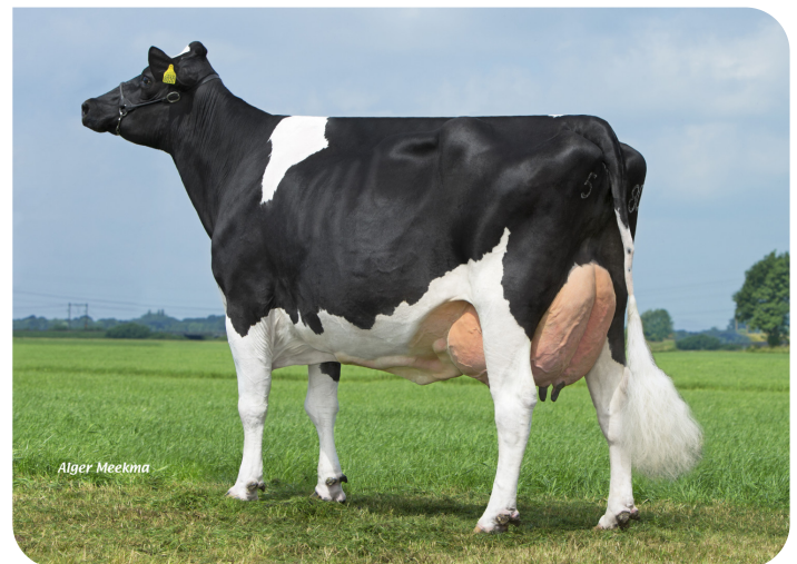
Poppe Fienchen 580 (VG 89) (great-great-grandmother of Magic Match Red)