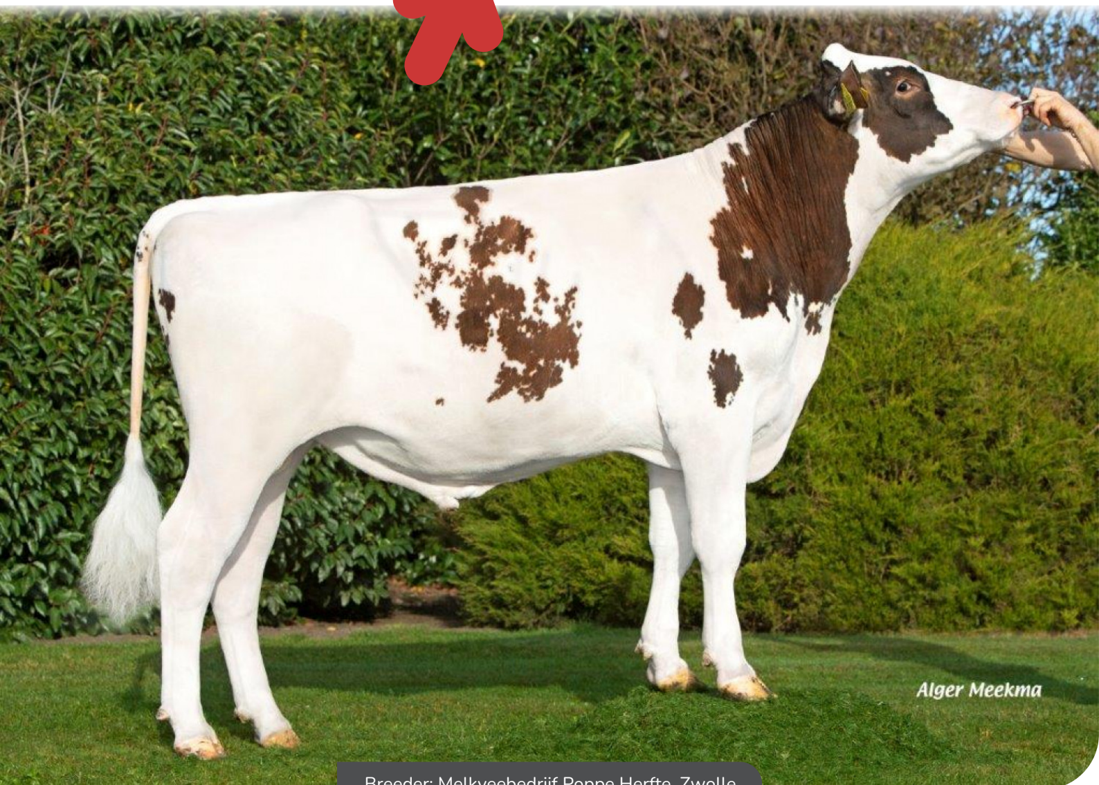
Breeder: Melkveebedrijf Poppe Herfte, Zwolle