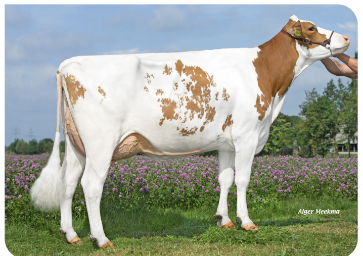
Poppe Fienchen 1270 (VG 86) (dam of Magic Match Red)