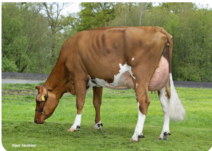
Diekers Anne Jose 35 (s. Kayne) Owner: Mts. Eiting, Rekken (NL)