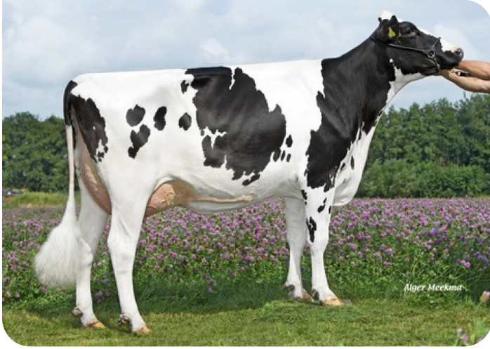
Wilder K41 RDC (VG 87) (Dam of Kayne)