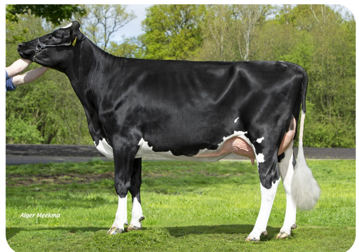
Diekers 3Star Ka Ida 3 (s. Kayne)