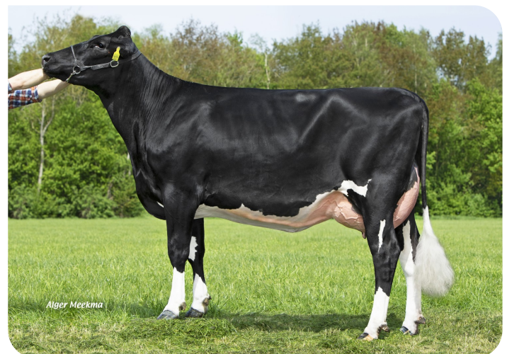
Grashoek Mona-Lisa 47 (s. Kayne) Owner: Fok- en melkveebedrijf K.I. Samen B.V., Grashoek (NL)