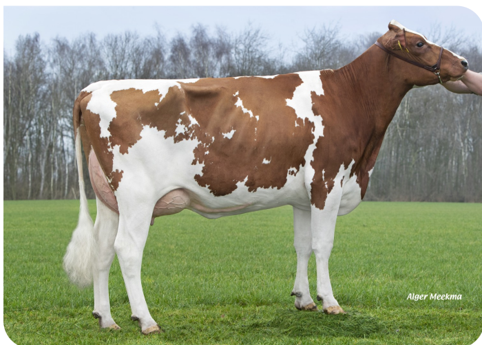
Grashoek Boukje 519 (s. Fame P)

Owner: Fok- en melkveebedrijf K.I. Samen B.V., Grashoek (NL)