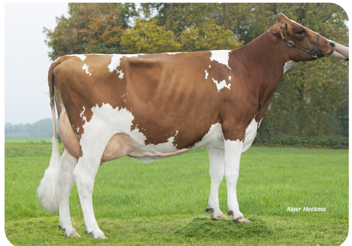
Sonja 112 (s. Fame P)

Owner: Fok- en melkveebedrijf K.I. Samen B.V., Grashoek (NL)