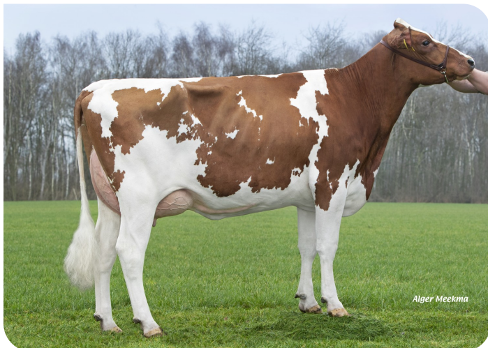
Grashoek Boukje 519 (s. Fame P)

Owner: Fok- en melkveebedrijf K.I. Samen B.V., Grashoek (NL)