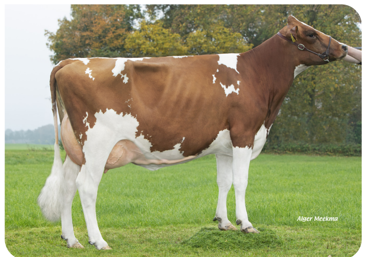
Sonja 112 (s. Fame P)

Owner: Fok- en melkveebedrijf K.I. Samen B.V., Grashoek (NL)