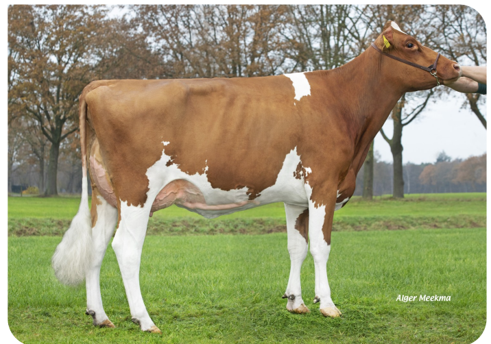
Kooifarm Lilly 7 (s. Fame P) Owner.: Klein Baltink C.V., Kring van Dorth (NL)