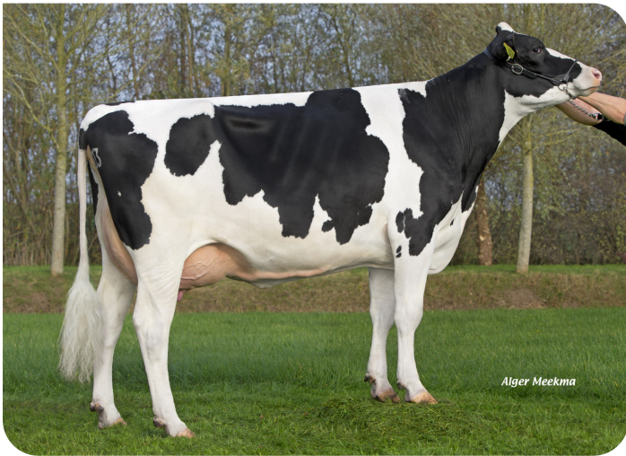
Poppe Fienchen 803 (AB 86) (Grandmother of Fame P)