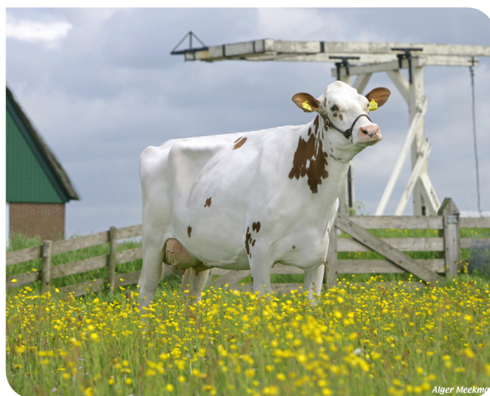
Esmeralda 181 (s. Sunflower PS rc)