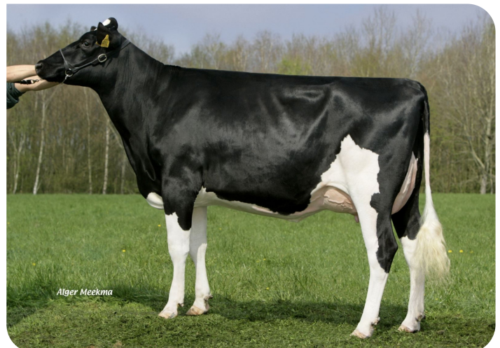
Grashoek Beaver 3 (VG 87) (s. Sunflower PS rf) Owner: Melkveebedrijf Grashoek b.v., Grashoek (NL)