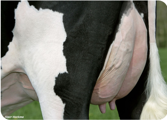
Udder of Grashoek Beaver 3 (s. Sunflower PS rc) Owner: Melkveebedrijf Grashoek b.v., Grashoek (NL)