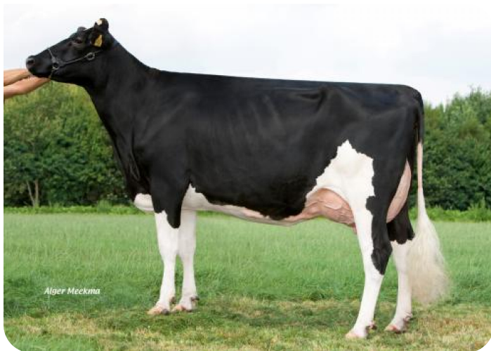
Grashoek Beaver 3 (EX 90) (s. Sunflower PS rc) Owner: Melkveebedrijf Grashoek b.v., Grashoek (NL)