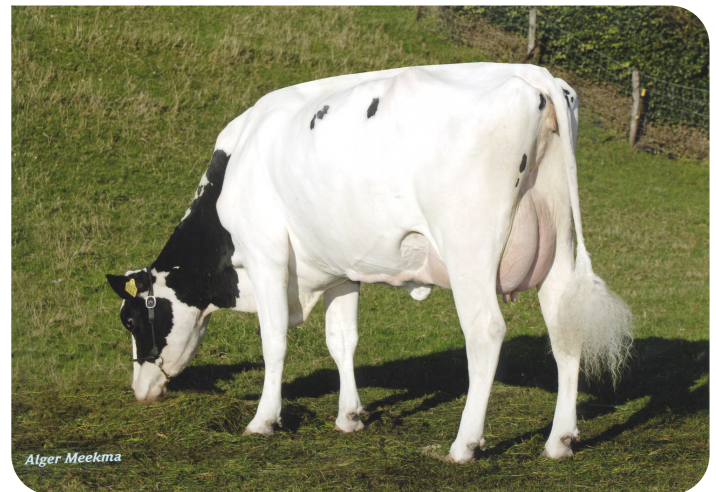
Ponsstar Samantha (EX 90) (dam of Maniac PS)