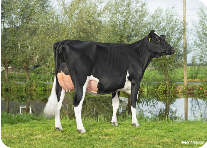
Nellie 258 (s. Florus)