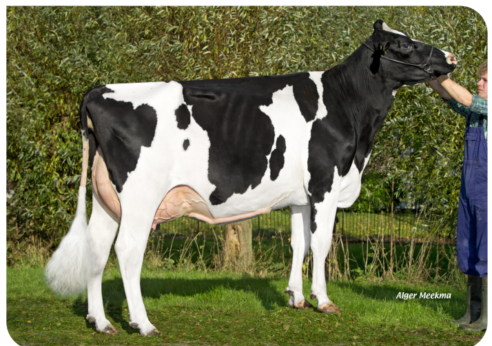
Plataan F7812 (VG 86) (dam of Florus)