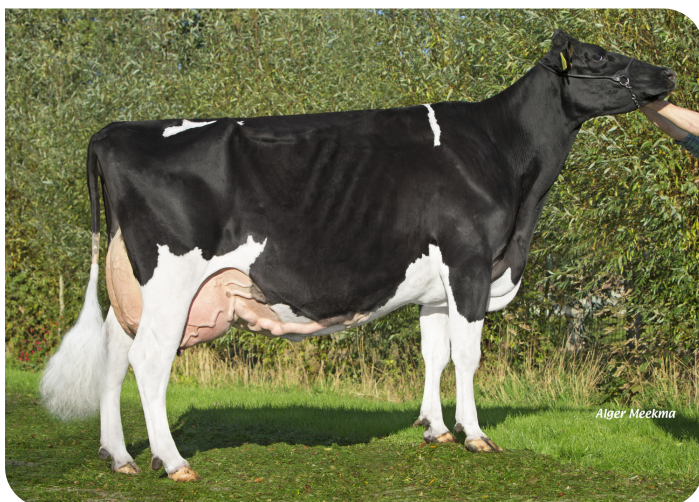
Plataan F8595 (VG 89) (grand-dam of Florus)