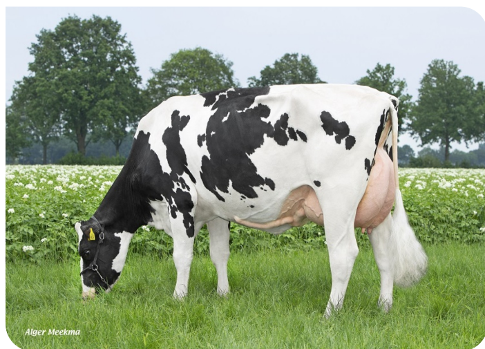
Peeldijker Liesje 1224 Grand dam of Pennywise