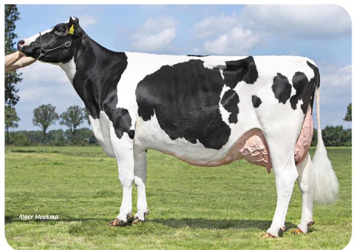
Peeldijker Liesje 1328 Dam of Pennywise