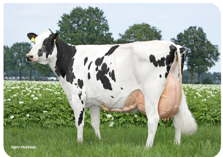
Peeldijker Liesje 992 Great-grand dam of Pennywise