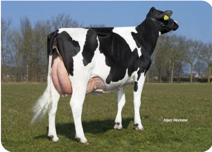
Grashoek Gredien 96 (s. Outlaw) Owner: Melkveebedrijf Grashoek b.v., Grashoek (NL)