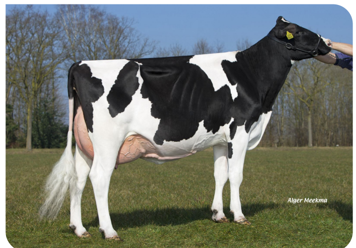
Grashoek Gredien 96 (s. Outlaw) Owner: Melkveebedrijf Grashoek b.v., Grashoek (NL)