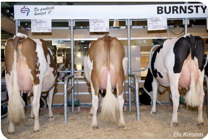
Daughter progeny Burnstyn Gorinchem 2012