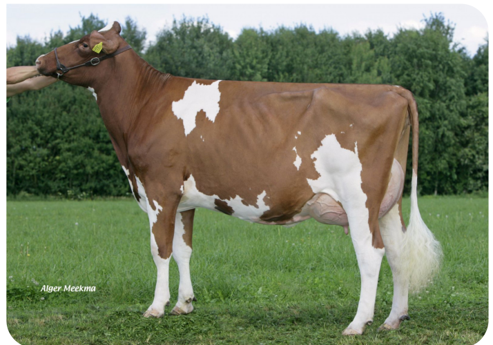
Bertha 98 (s. Burnstyn) Owner: Melkveebedrijf Grashoek b.v., Grashoek (NL)