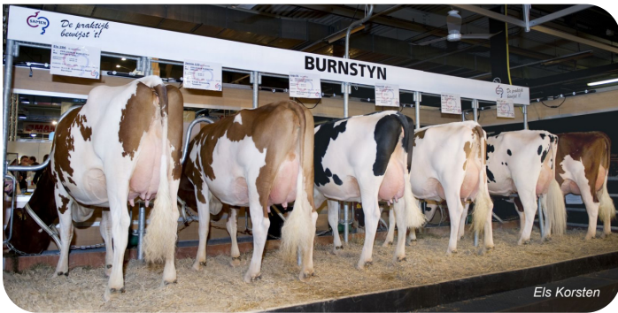
Daughter progeny Burnstyn Gorinchem 2012