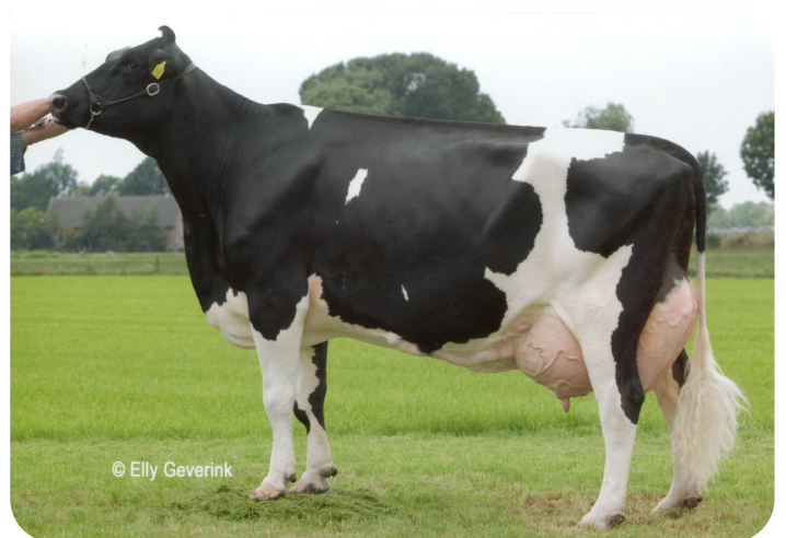
Peeldijker Liesje 385 (EX 90) (granddam of Burnstyn)