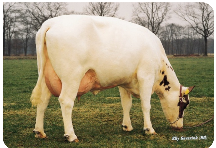
Elly Geverink (HG)