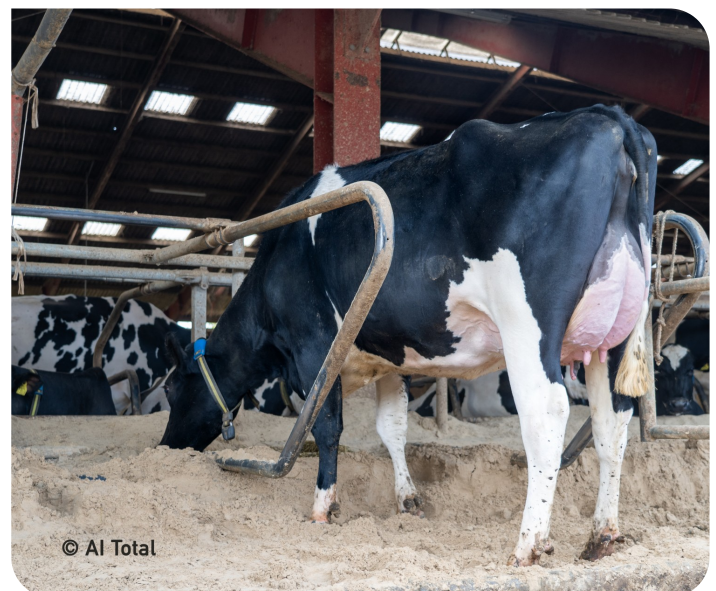
Daughter of Neal (1)