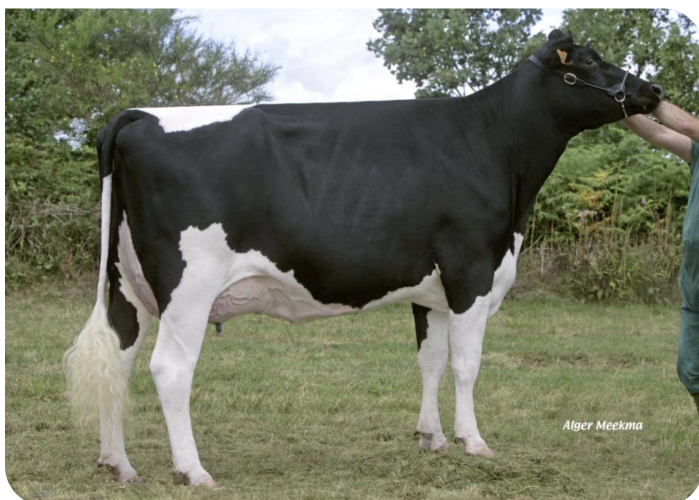
Dalsamine Great-great grand dam of Neal