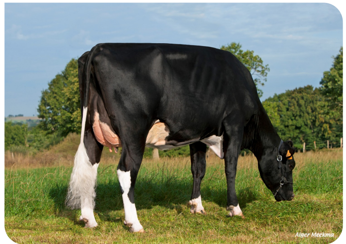
Falsamine Great-grand dam of Neal