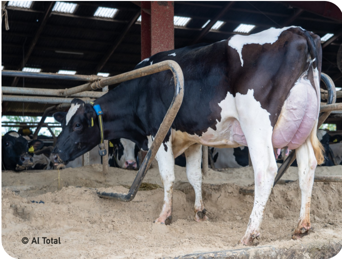
Daughter of Neal (2)