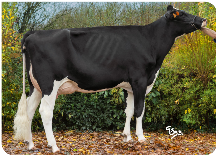
IdealeGrand dam of Neal