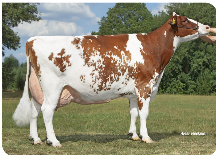
Roza 74 (EX 91) dam of Mostwanted Red