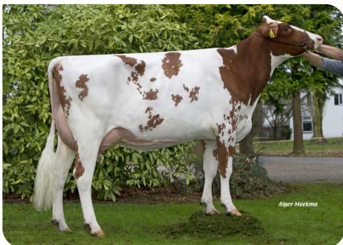
Rika 21 (s. Totilas)