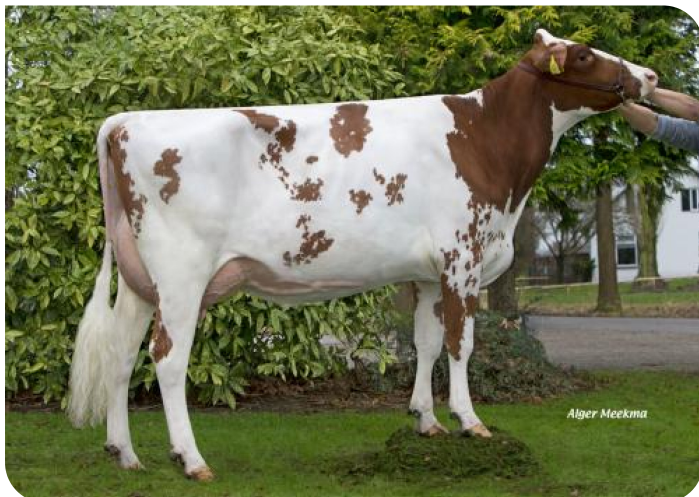
Rika 21 (s. Totilas)