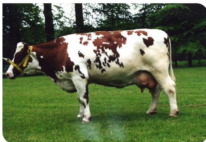
Merlin 29 (dam of Gerbert)