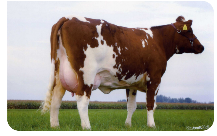
Coba 267 (dam of Prins)