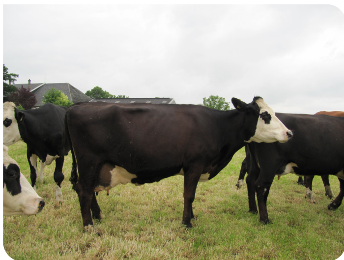
Mathilde 107 (dam of Matts)