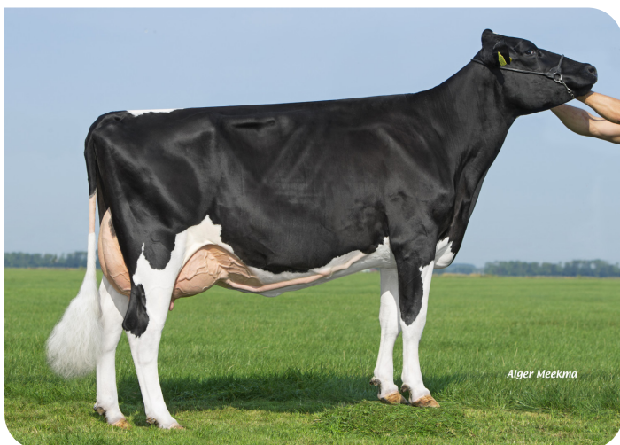
Koolstein Akke 183 (s. Fletcher) Owner: VOF Kool, Appingedam (NL)