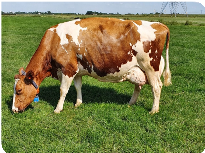
Mariahoeve Trees 142 (dam of Tribute Red)